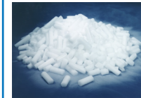
Dry ice pellets for cooling purposes