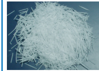
Dry ice pellets for blasting purposes

Be it for blasting or cooling, catering or transportation purposes, ASCO has your dry ice solution for all your requirements. Please contact our specialists for further information.