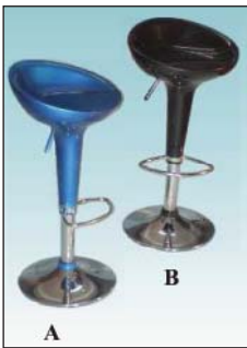
Bar Stool (Adjustable) H - 50cm