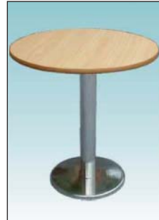
Round Table (Wooden top)