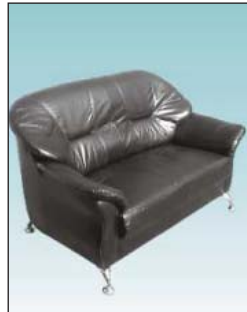
VIP Sofa Double