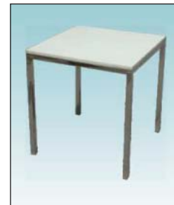
Square Table W H D 70cm 70cm 70cm