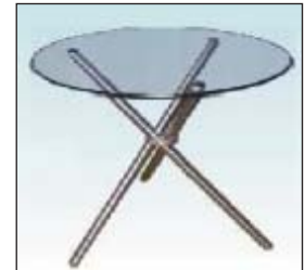
Round Table (Glass top)