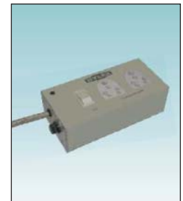
Socket Out Let