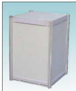
Podium W H D 50cm 70cm 50cm