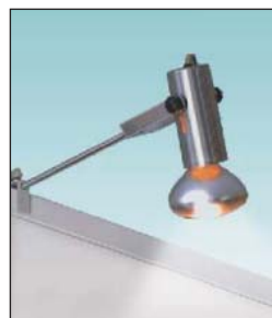
Arm Spot Light