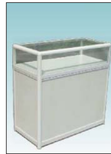
Glass Counter W H D 100cm 100cm 50cm