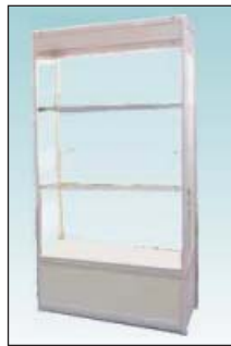
Glass Show Case W H D 100cm 200cm 50cm