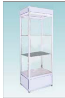
Show Case (Slim) W H D 50cm 200cm 50cm