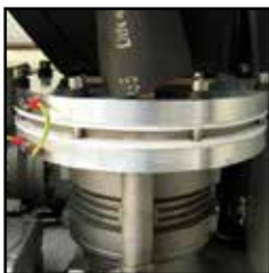
Distributor unit for pulsation-free blasting