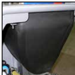
Insulated pellet hopper with 23 kg (50.7 lb) capacity