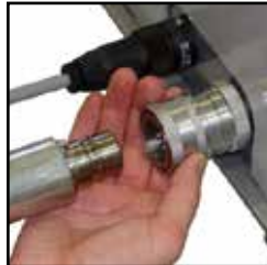
Quick connect coupling at blasting hose