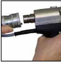
Powerful and handy blasting gun with quick connect coupling