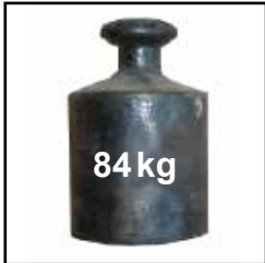
Lightweight and compact