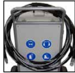
Integrated holding device for hose