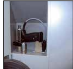
Box for gun, nozzles and tools