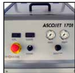
Control panel for easy overview