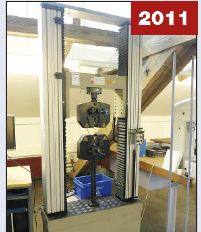
testing machine Walter + Bai