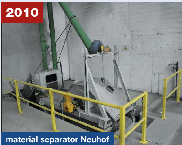
material separator Neuhof