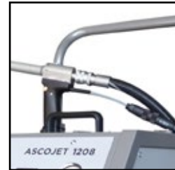
Vertically adjustable handle for easy handling