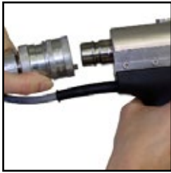
Powerful and handy blasting gun with quick connect coupling