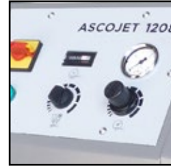
Control panel for easy overview