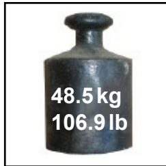
Very lightweight and compact