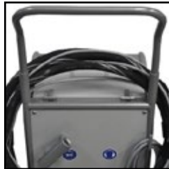
Integrated holding device for hose