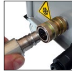
Quick connect coupling at blasting hose