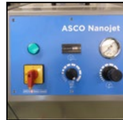
Control panel for easy overview