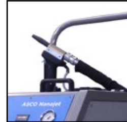
Vertically adjustable handle for easy handling