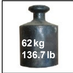
Lightweight and compact