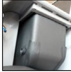
Insulated pellet hopper with 6 kg (13.22 lb) capacity