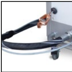
Integrated grounding roll for more safety