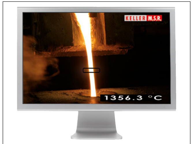
Fig. 8 Video image shows targeted measurement area and superimposed temperature reading

Because the position of the pour stream can vary with the tilt angle or due to clogging and wear of the pouring nozzle, an optical measurement technique is essential. A built-in video camera is ideal for target sighting because of the difficulty in safely accessing the installed pyrometer during running operations. State-of-the-art cameras feature TBC (Target Brightness Control). The light exposure of the image is not averaged over the total illumination, but rather based on the specifically targeted measurement area. The result is a high-contrast image of the bright pour stream in front of a dark background. The image of the molten metal pour stream at the video display terminal will always appear at optimum exposure.