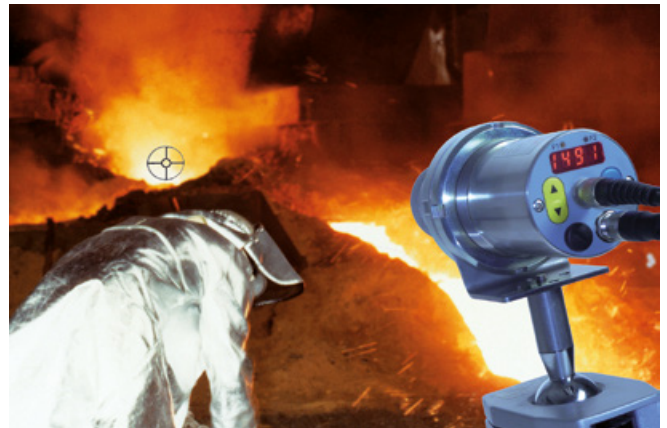
Fig. 3 Measurement at the tap hole of a blast furnace, carried out at considerable distance

At the passage where liquid metal is transferred from the blast furnace/cupola furnace to the forehearth, temperature is typically measured at irregular intervals by means of a thermo-