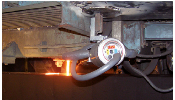
Fig. 5 Optical temperature detection at a casting machine

With optical temperature detection at metal casting operations, a pyrometer is focused on the free falling liquid metal stream just as it is poured into the mold ( Fig. 5 ). The ATD func-