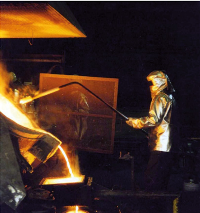
Fig. 1 Conventional temperature measurement of liquid metal using an immersion probe

Temperature is one of the most critical process parameters affecting the resulting quality, strength and working properties of a metal casting. Thanks to modern infrared thermometers, the temperature of molten metal can be accurately monitored continuously and without contact at various stages of production. The benefits: non-contact temperature detection requires far less use of immersion probes and results in reduced scrap.