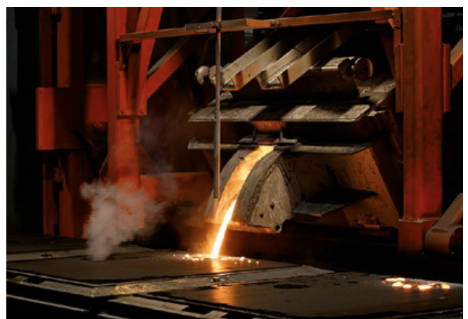
Fig. 6 Position of pour stream varies with the tilt angle of the ladle

Compounding the problem: the position of the liquid metal pour stream fluctuates. The pouring point is influenced by factors such as the tilt angle of the ladle or the stopper rod in the tapping hole of bottom pour ladles ( Fig. 6 ).