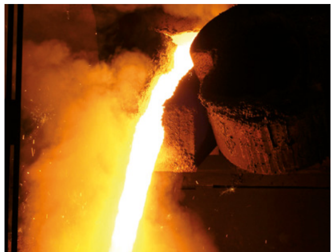
Fig. 4 Transfer of molten iron from the melting furnace into the pouring ladle

Temperature is of crucial importance as the molten metal passes from the melting furnace or forehearth to the transfer ladle or pouring ladle ( Fig. 4 ). The liquid metal must be poured